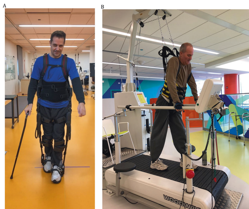
Fig. 1 Electromechanical devices used for the active intervention groups. A Photograph with permission, showing an SCI participant training in the robotic exoskeleton suit. B Photograph with permission, showing an SCI participant from the Active Control group training using the body weight supported treadmill prior to overground stepping practice.

All analyses were performed using JMP Statistical Software, Version 15.0 (SAS Institute Inc., Cary, NC).